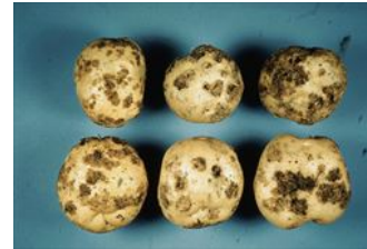
Photo 1. Common scab on potato, Streptomyces scabiei .