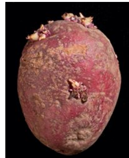
Photo 1. Potato tuber with raised brown 'scabs' of powdery scab, Spongospora subterranea .

Spongospora subterranea f.sp. subterranea . It is a member of the family Plasmodiophoraceae, the same family as that of Plasmodiophora brassicae , the cause of club root of brassicas ( see Fact Sheet no. 283 ). Like Plasmodiophora brassicae , powdery scab belongs to a group called rhizaria in the Kingdom Protista; they are related to slime moulds.