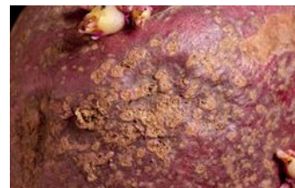
Photo 2. Close-up of Photo 1: potato tuber with symptoms of powdery scab, Spongospora subterranea .