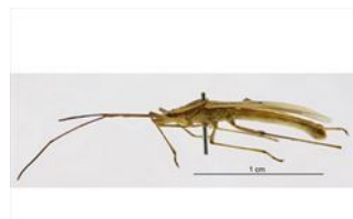
Photo 2. Adult rice seed bug, Leptocorisa acuta , side view.