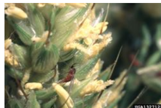
Photo 1. Adult sorghum midge, Stenodiplosis sorghicola .