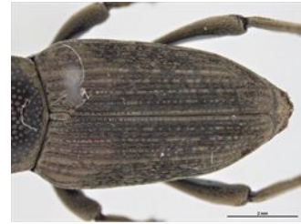
Photo 2. Abdomen of the sugarcane weevil borer, Rhabdoscelus obscurus , showing the colour pattern.