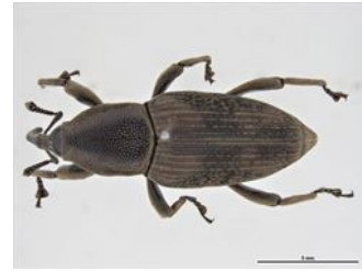
Photo 1. Adult sugarcane weevil borer, Rhabdoscelus obscurus .