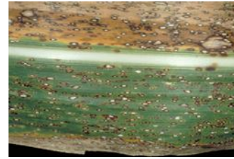
Photo 1. Oval spots, purple at first and later white with red margins, of white rash, Elsinoe sacchari .