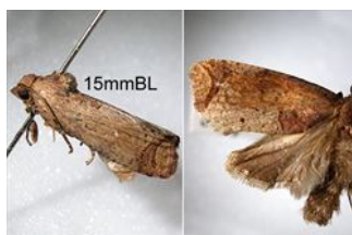
Photo 4. Adult Tahitian chestnut moth, Cryptophlebia pallimfimbriata (Cook Islands).