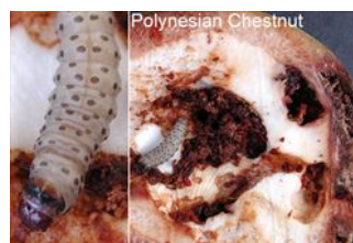
Photo 3. Larva of Cryptophlebia pallimfimbriata , tunnelling in a fruit of Tahitian chestnut, Inocarpus fagiferus .