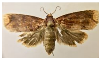
Photo 5. Adult Tahitian chestnut moth, Cryptophlebia pallimfimbriata (Fiji).