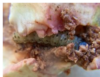
Photo 2. Larva of Cryptophlebia pallimfimbriata tunnelling into a Tahitian chestnut fruit, Inocarpus fagiferus .