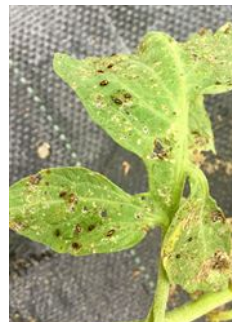
Photo 3. Tobacco flea beetle, Epitrix hirtipennis , feeding on tomato