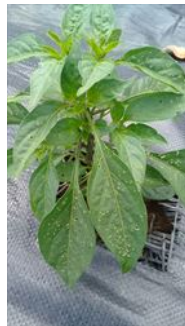
Photo 9. Symptoms of tobacco flea beetle, Epitrix hirtipennis , on capsicum.