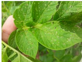
Photo 10. Symptoms of tobacco flea beetle, Epitrix hirtipennis , on potato.