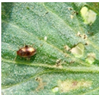
Photo 4. Adult tobacco flea beetle, Epitrix hirtipennis , and holes eaten in a tomato leaf.