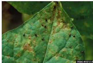
Photo 8. Irregular patches on leaf of tobacco where surface layers have been chewed by the tobacco flea beetle, Epitrix hirtipennis .