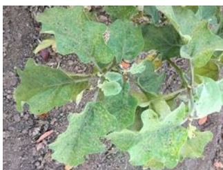
Photo 5. Severe damage on eggplant by the tobacco flea beetle, Epitrix hirtipennis .