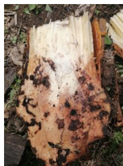
Photo 2. Banana corm cut vertically to show tunnelling by banana weevil, Cosmopolites sordidus , (from Photo 1).