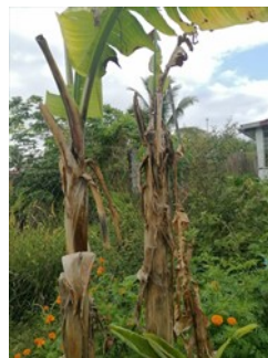
Photo 1. Poor growth of bananas with extensive tunnelling in the corm (see Photos 2&3).