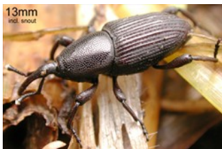
Photo 4. Adult banana weevil, Cosmopolites sordidus .

Igoa Faasaienisi: Cosmopolites sordidus .