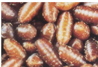
Photo 6. Fruit fly pupae.