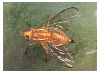
Photo 2. Pacific fruit fly, Bactrocera xanthodes .