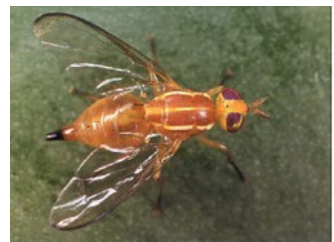
Photo 3. Bactrocera xanthodes .