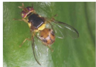
Photo 2. Bactrocera facialis .