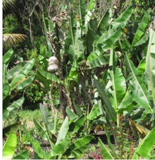
Photo 9. Banana leaves used to wrap a fruit bunch to prevent attack by fruit flies, other pests, and to promote uniform ripening, in Papua New Guinea.