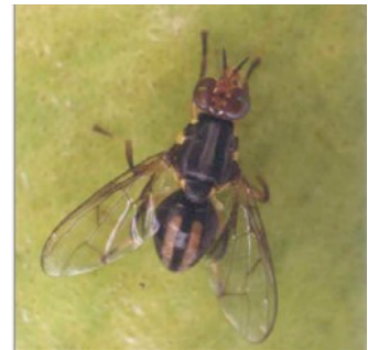
Photo 1. Bactrocera kirki .

Ko e lango huhukia Pasifiki, Bactrocera xanthodes oku vaofi 'aupito ia ki he kalasi kehe 'e 3. 'A ia ko e Bactrocera paraxanthodea o Niukaletonia, Bactrocera neoxanthodes i Vanuatu, pea moe kalasi 'oku te'eki ai ke fakahingoa 'i Ha'amoia.