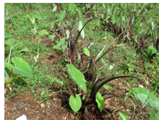
Photo 2. Severe damage to taro caused by the taro hornworm, Hippotion celerio ; the leaves have been eaten leaving only the leaf stalks or petioles.