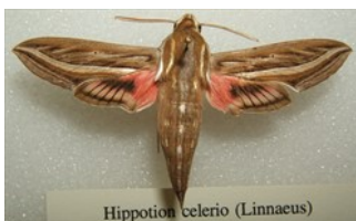
Photo 6. Adult taro hornworm, Hippotion celerio .