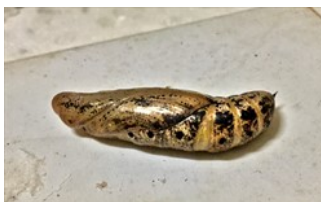
Photo 5. Pupa taro hornworm, Hippotion celerio .