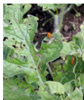
Photo 4. Red pumpkin beetles, Aulacophora sp., cutting leaf circles from watermelon.