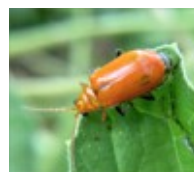
Photo 3. Red pumpkin beetle, Aulacophora sp., showing the groove on the thorax. Compare with Monolepta .