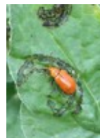
Photo 2. Red pumpkin beetle, Aulacophora sp., eating circles on a leaf.