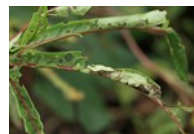
Photo 1. Caterpillar of Haritalodes derogata rolling leaves of bele .

Saentifik nem: Haritalodes derogata ; festaem oli singaotem Sylepta derogata .