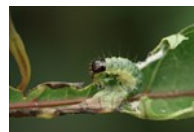
Photo 3. Caterpillar of the bele (cotton) leaf roller, Haritalodes derogata .