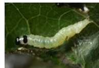
Photo 2. Caterpillar of the bele (cotton) leaf roller, Haritalodes derogata , showing the dark spots behind the head.