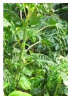
Photo 6. Curling and drooping of leaves attacked by the bele (cotton) leaf roller, Haritalodes derogata .