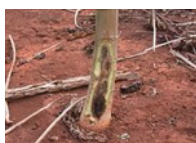
Photo 5. Stem rot on papaya caused by Phytophthora palmivora .