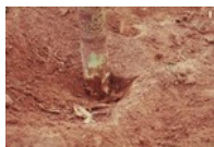
Photo 4. Lower stem or "foot" rot on papaya caused by Phytophthora palmivora .