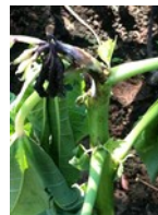
Photo 2. Bele wilt, Phytophthora nicotianae , showing the death of the young shoot at the top of the plant.