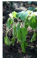
Photo 1. Bele wilt, caused by the water mould, Phytophthora nicotianae , attacking the roots.

Saentifik nem: Phytophthora nicotianae ; fastaem oli singaotem Phytophthora nicotianae pv. parasitica .