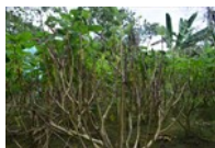
Photo 5. Several plants have lost their leaves and are dying due to root and basal stem rot caused by Phytophthora nicotianae .