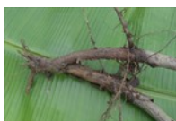
Photo 4. Root rot caused by Phytophthora nicotianae . Note the lack of roots, and that the lower stem has lost its bark, exposing the wood.