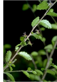
Leaves and female flowers.