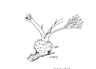
Illustration of female flower. Drawn by R.J. Cranfield