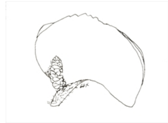
Illustration of lateral view of female bract, and at base a portion of male inflorescence. Drawn by R.J. Cranfield