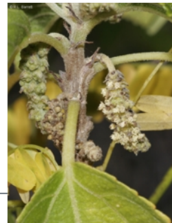
Male inflorescence.