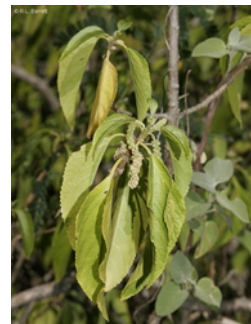
Leaves and male inflorescence.