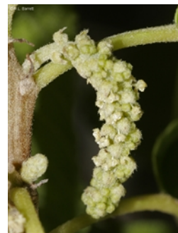
Male inflorescence. © R.L. Barrett