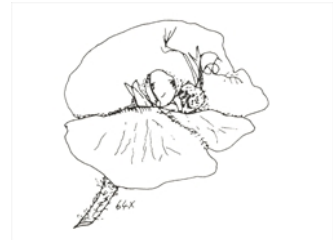
Illustration of female bract opened out. Drawn by R.J. Cranfield