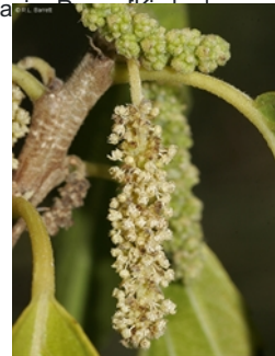
Male inflorescence.