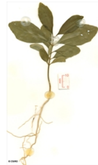
Cotyledon and 1st leaf stage, epigeal germination.