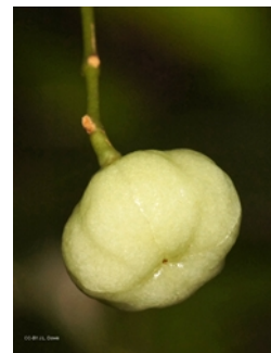
Fruit.