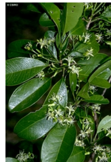
Leaves and Flowers. © CSIRO