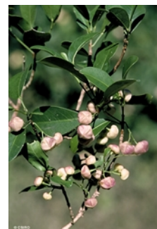
Leaves and immature fruits.