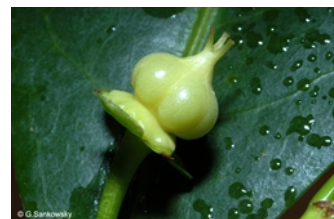
Female Flower. © G. Sankowsky