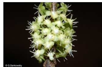
Male Flowers.