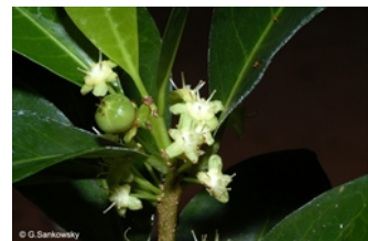
Male flowers and immature fruit.