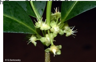
Male and Female Flowers. © G. Sankowsky