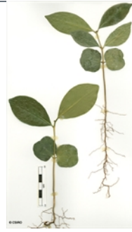
Cotyledon stage, Epigeal germination.