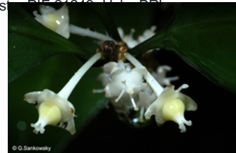
Male and female flowers.