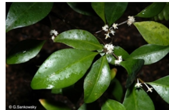
Leaves and flowers.