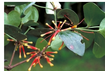
Leaves, Flowers.