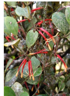
Leaves, Flowers.