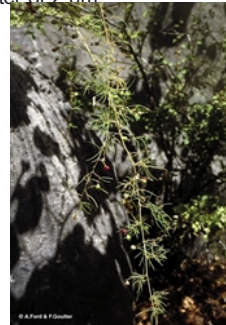
Foliage and fruit.