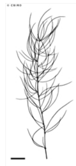
Scale bar 10mm.