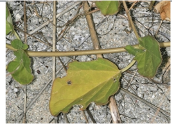
Leaves.