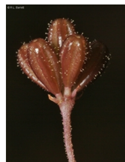
Fruit.