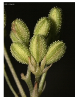
Fruit.