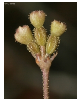
Flower buds.