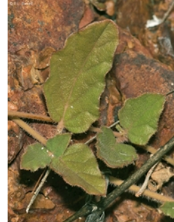
Leaves.