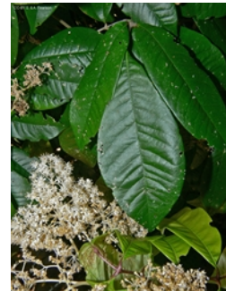
Inflorescence and leaves [not vouchered].