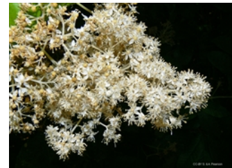
Flowers [not vouchered].