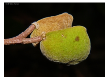
Follicles [not vouchered].