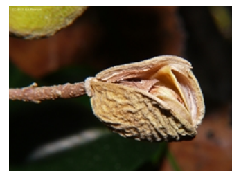
Dehiscent fruit [not vouchered].