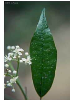
Leaf and inflorescence [not vouchered].