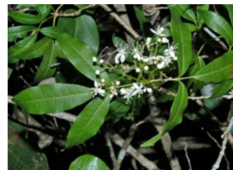
Leaves and flowers. © G. Sankowsky