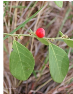
Leaves and fruit [not vouchered].