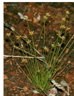
Whole plant, leaves and inflorescences.