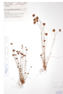
Herbarium specimen.