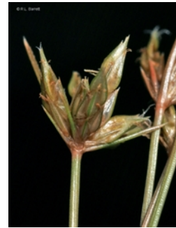
Inflorescence. © R.L. Barrett