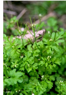
Flowers and immature fruit. © ATH

Copyright © CSIRO 2020, all rights reserved.