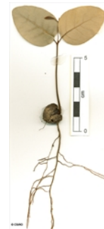
Cotyledon stage, hypogeal germination.