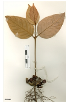
Cotyledon stage, hypogeal germination.