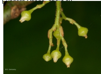
Flowers [not vouchered]. © G.