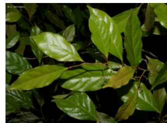
Leaves [not vouchered]. © G.