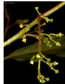
Flowers [not vouchered].