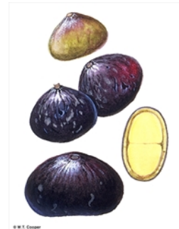
Fruit, four sides views and cross section. © W. T. Cooper