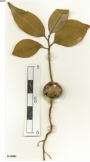
Cotyledon stage, hypogeal germination.