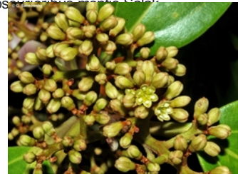
Flowers [not vouchered]. © G.