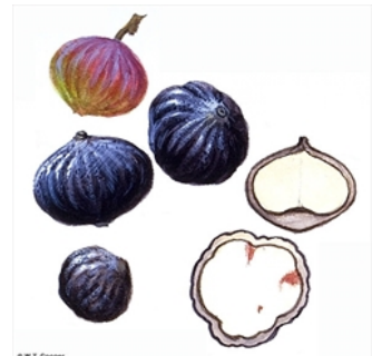
Fruit, several views, cross and longitudinal sections. © W. T. Cooper