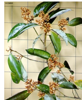
Habit, leaves and flowers.