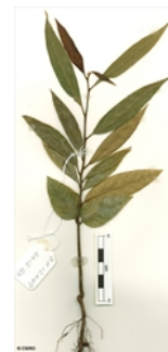
10th leaf stage.