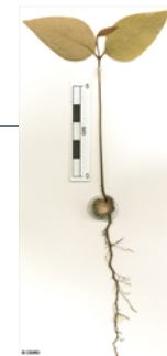
Cotyledon stage, hypogeal germination.