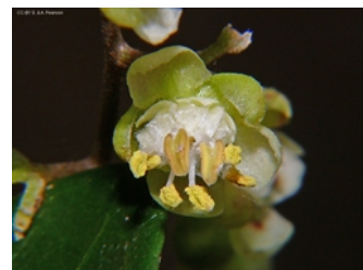
Flower [not vouchered].