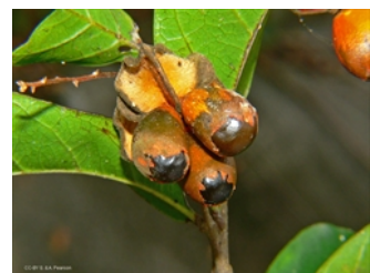
Seeds with aril [not vouchered].