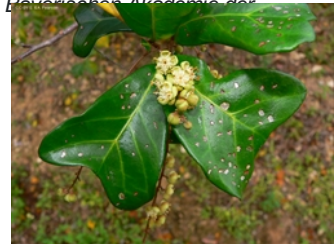
Leaf and inflorescence [not vouchered].