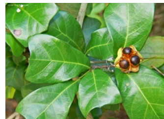
Dehiscent capsule [not vouchered].