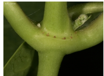
Junction of leaf petiole and stem.