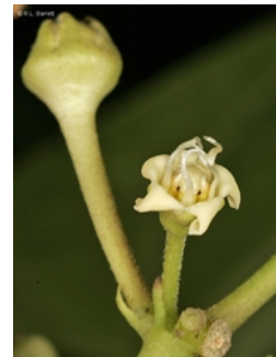
Flower. © R.L. Barrett