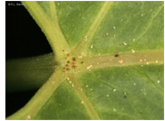
Colleters at leaf lamina base.