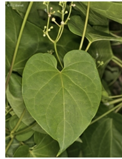
Leaf.