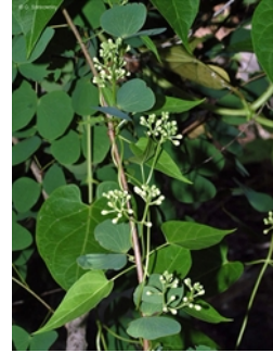
Leaves and flowers. © G. Sankowsky