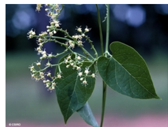
Leaves and Flowers.