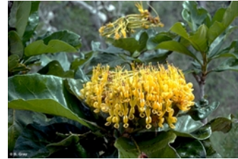
Leaves and Flowers.