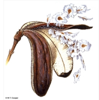
Fruit and seeds. © W. T. Cooper