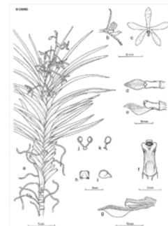
Habit, flower.