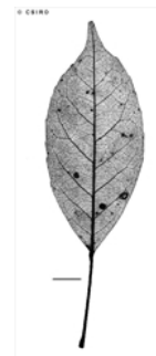
Scale bar 10mm. © CSIRO

Copyright © CSIRO 2020, all rights reserved.