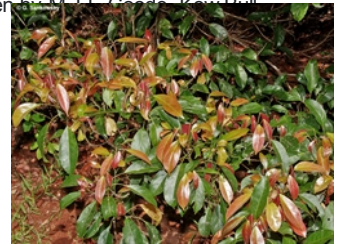
Habit and leaves [not vouchered].