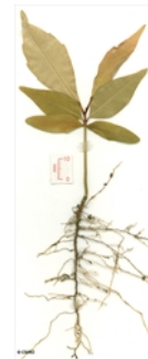
Cotyledon stage, epigeal germination. © CSIRO

Copyright © CSIRO 2020, all rights reserved.