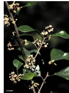
Male flowers.