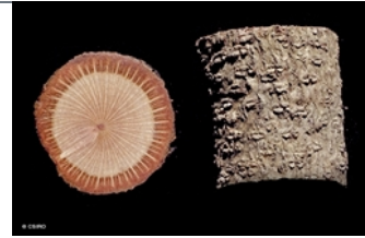
Vine stem bark and vine stem transverse section.