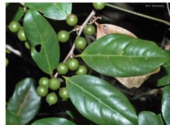
Leaves and immature fruit.