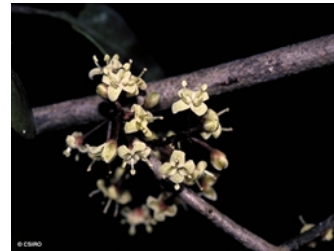
Male flowers.