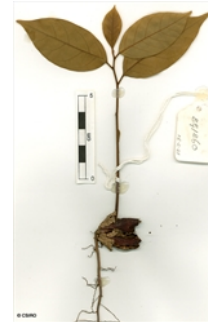
Cotyledon and 1st leaf stage, hypogeal germination.