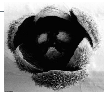
Flower, bird's-eye view Tepals & tips of three anthers.