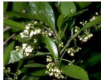
Leaves and Flowers.