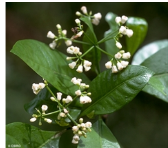
Leaves and Flowers. © CSIRO