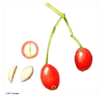
Fruit, side views, cross section and seeds. © W. T. Cooper