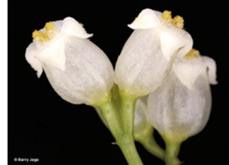
Flowers.