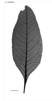
Scale bar 10mm. © CSIRO

Copyright © CSIRO 2020, all rights reserved.