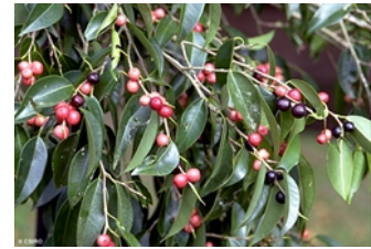
Leaves and figs.