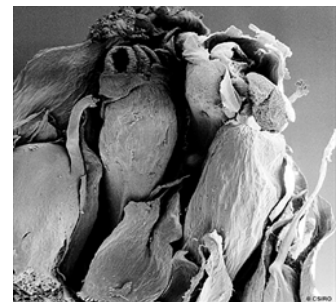
Female flowers. © CSIRO