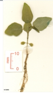
Cotyledon stage, epigeal germination.