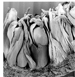
Male & female flowers(?).