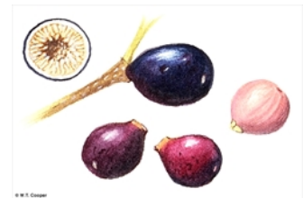
Figs, side view and cross section.