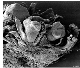
Group of male flowers, side view Anthers two-celled.