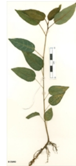
10th leaf stage.