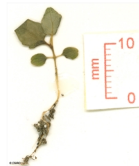
Cotyledon stage, epigeal germination.