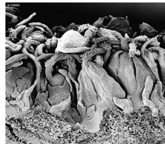
Female flowers or gall flowers.