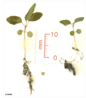
Cotyledon stage, epigeal germination. © CSIRO

Copyright © CSIRO 2020, all rights reserved.