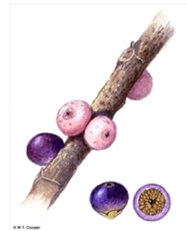
Figs, various views and cross section. © W. T. Cooper