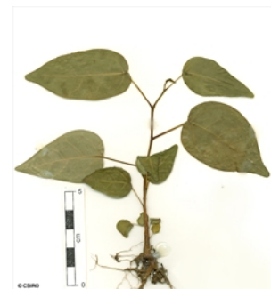
10th leaf stage.