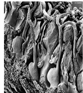
Female flowers. © CSIRO