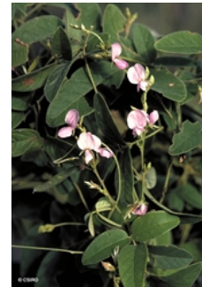
Leaves and Flowers.