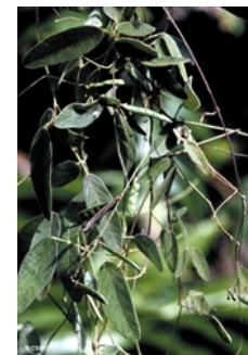
Leaves and Flowers. © CSIRO