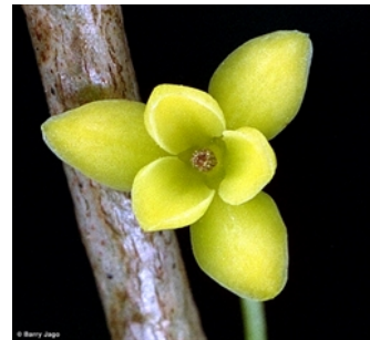
Male flower.