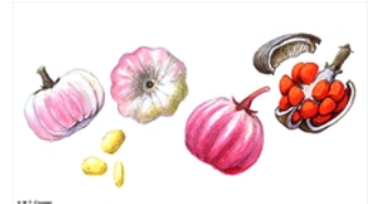
Fruit, three views, dehiscent and arilless seeds. © W. T. Cooper