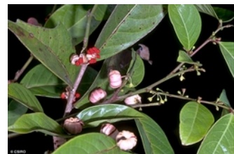
Leaves, flowers and fruit. ©