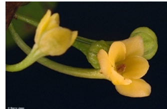
Male flowers.