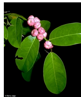
Leaves and fruit.