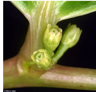
Female flowers.