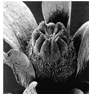
Female flowers.