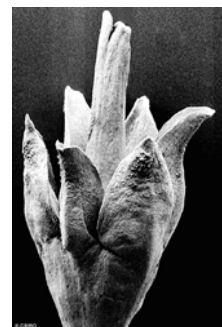
Female flower Note long stout style.