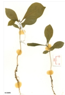
Cotyledon stage, epigeal germination.