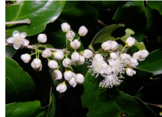
Flowers [not vouchered]. © G.