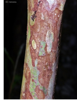
Trunk [not vouchered].