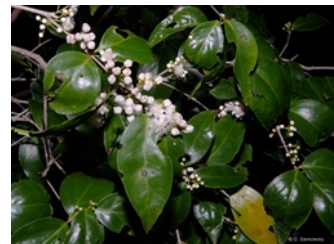
Leaves and flowers [not vouchered].