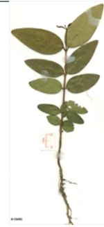
10th leaf stage. © CSIRO