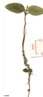
Cotyledon stage, epigeal germination.