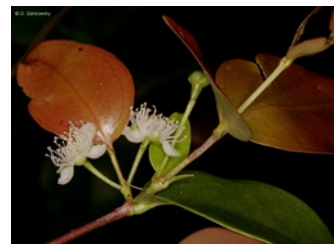
Young leaves and flowers [not vouchered]. © G. Sankowsky