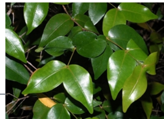
Leaves [not vouchered].