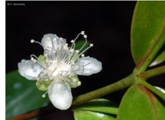
Flower [not vouchered].